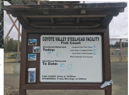
Bulletin Board with fresh new white board purchased by UVFWC