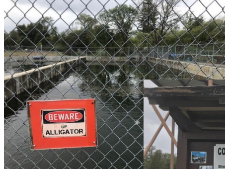
“Beware of Alligator” sign and fake alligators in water donated by UVFWC & enjoyed by the visitors