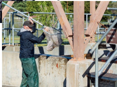
UVFWC Volunteer Troy P. netting a steelhead